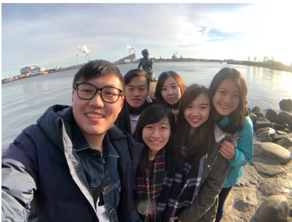
Little Mermaid, Copenhagen

School started on 7 Jan and BI prepared numbers of orientation activities for international students, such as ice skating, Learning Norwegian, sightseeing and Night party. I had class on Monday to Thursday so we can travel to other places during weekends. I went to Copenhagen and Stockholm in January by overnight bus. Most of the metro station in Stockholm are decorated with artwork so we visited some of them.