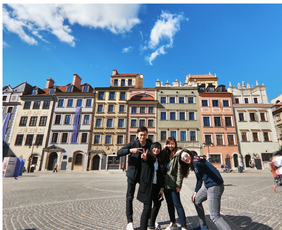
Warsaw Old Town

We were having a long Easter holiday on April followed by two final exams on late April. So I went for a 11-day trip on early April. I went to Poland, Czech Republic, Austria and Hungary. We travelled to different countries by taking bus. It only takes about three hours each trip. The price level in Poland is much cheaper than Oslo. We also went to Hallstatt that I highly recommend to visit. It is considered as one of the most beautiful towns in the world.