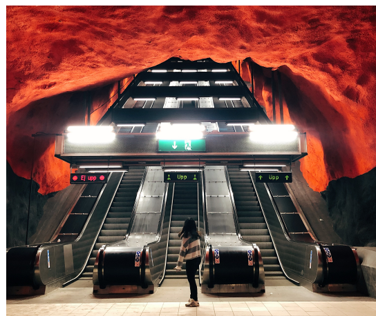
Solna Centrum, Stockholm