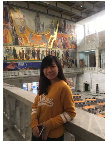
City Hall, Oslo

School started on 7 Jan and BI prepared numbers of orientation activities for international students, such as ice skating, Learning Norwegian, sightseeing and Night party. I had class on Monday to Thursday so we can travel to other places during weekends. I went to Copenhagen and Stockholm in January by overnight bus. Most of the metro station in Stockholm are decorated with artwork so we visited some of them.