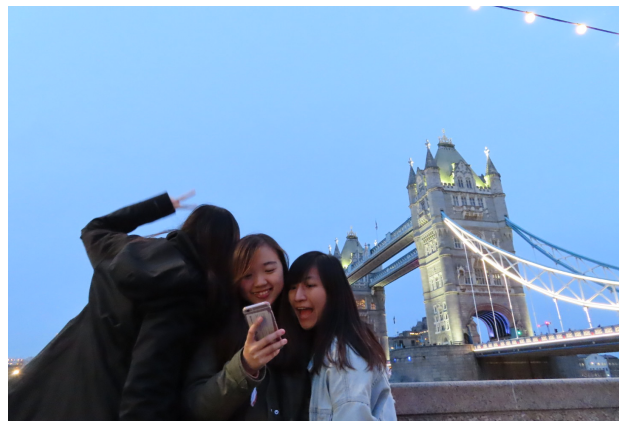
Tower Bridge, London