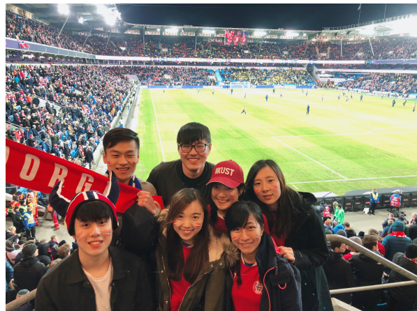
Norway vs Sweden