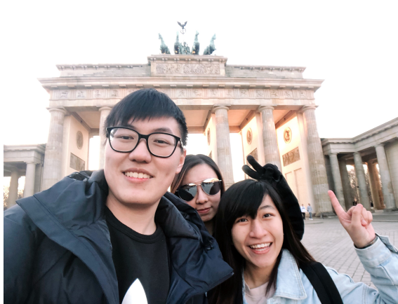
Brandenburgen Tor, Berlin

The workload in BI was not heavy that it allows us to keep travel around. I went to Berlin, Tallin and Finland. We travelled to Helsinki and Rovaneimi in Finland and they gave me a completely different experience as Helsinki is much modern while Rovaneimi is the Santa Claus Village. We had the husky ride and reindeer ride in the Santa Claus Village which is an unforgettable experience. We also spent one day in Tallin. It is near Helsinki that we can go there by taking a 2.5-hour cruise ship.