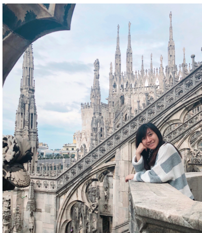
Duomo di Milano, Milan

I finished all my final exams on April so I travelled to Italy on early May. I went to Milan, Cinque Terre, Pisa, Pompeii, Rome during the trip. Italy is quite hot so I finally could wear short sleeves shirt during the trip. There were many tourists in Italy that we needed to queue for every tourist spots and sometimes it took more than one hour. I went on a two-day trip to Bergen. I followed the route of “Norway in Nutshell” and bought the ticket by myself as it would be much cheaper. We could enjoy the natural scenery of fjord and mountain during the train and cruise journey. On 17 May, it is the Norway National Day. Most of the Norwegian would wear Norwegian traditional clothing with National flag in hands. I also went in front of the Royal Palace to enjoy the celebration with my friends. I came back Hong Kong on 21 May.