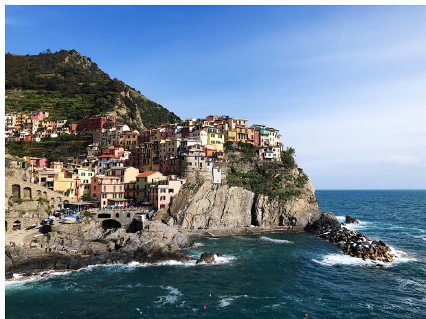
Cinque Terre, Italy