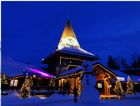
Santa Claus Village